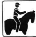
[4] ★H & R