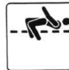
[8] ★H & J