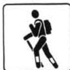
[3] ★B & W