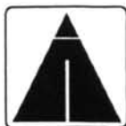
[1] ★C & G

Write a caption to go with each illustration . (Note: You may need to add suffixes or common word endings to match the R.W.C.)