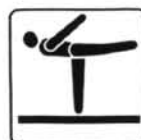
[7] ★B & B