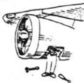
[2] ★J & E