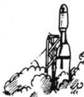
[5] ★B & O